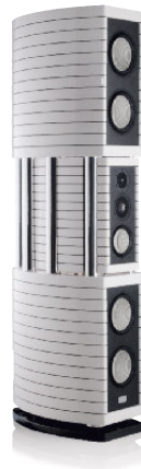
BERLINA RC 11